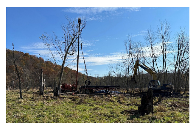
Oil well site in wetland at Bowfin Bottom Preserve

include construction of several wetland pools at locations of abandoned agricultural fields that are dominated by invasive Reed Canary Grass. Culverts will be placed along the former railroad bed to allow floodwater to spread across the entire floodplain, enhancing the riparian wetlands. Where possible, drainage ditches will be filled and tiling disrupted to further enhance hydrologic function in the floodplain, storing and slowly releasing water to reduce flooding and erosion downstream. Water quality improvements will include the reduction in sediment, nutrients and bacterial load in the Killbuck Creek.