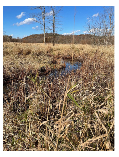
Lower Laurel Creek at Crane Swamp

KWLT recently received more exciting news as we have been awarded an H2Ohio Program Grant for a wetland restoration at Crane Swamp! The H2Ohio Program provides funding for high- guality naturalinfrastructure projects focused on nutrient reduction and water quality improvement across the state of Ohio. The Crane Swamp project focuses on the hydrologic enhancement and restoration of over 150 acres of riparian wetlands on the floodplain of Killbuck Creek. The restoration will