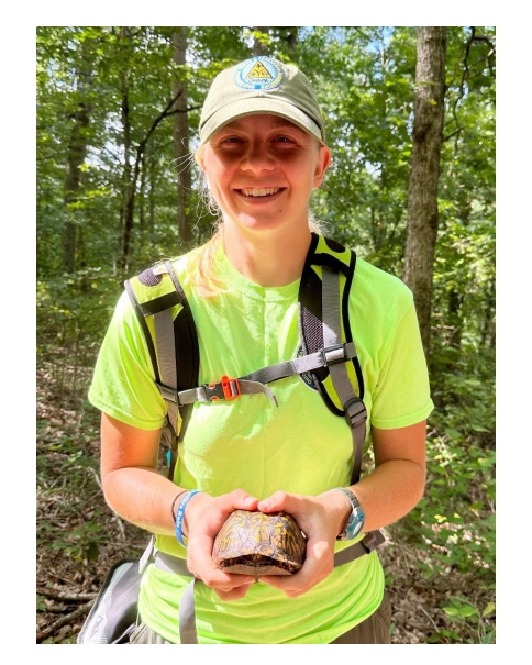
ONAPA Stewardship Assistant

here has been a lot of activity at several I of KWLT's preserves. On October 28, Ohio Natural Areas and Preserves Association (ONAPA) partnered with KWLT at Brinkhaven Oak Barrens Nature Preserve to remove invasive woody plants from the lower barrens. The weather cooperated, and we had a great turnout with 16 volunteers, including half a dozen college students from the OSU Botany Club. Many thanks to ONAPA in providing groups of enthusiastic, trained volunteers!